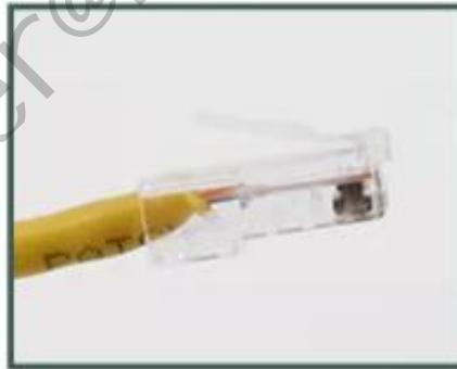
8. The network cable is completed