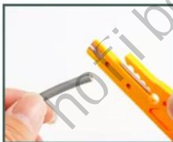
1. Take the positive wire stripper