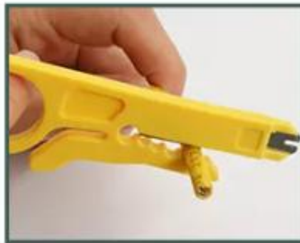
2. Rotary wire stripper