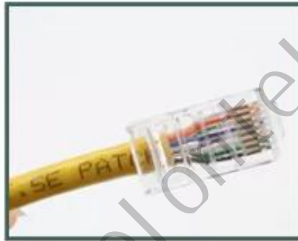
5. Insert the network cable into the modular plug