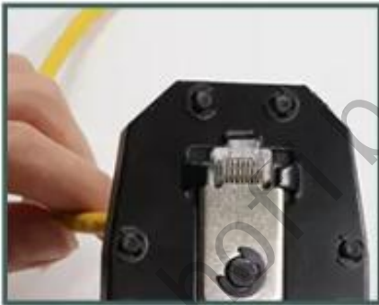
7. Press the handle to the bottom