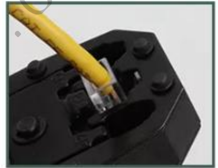
6. Put the modular plug into the crimping port