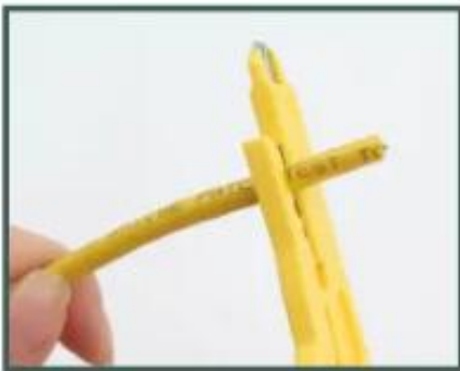
1. Put the two ends of the cable into the stripping knife