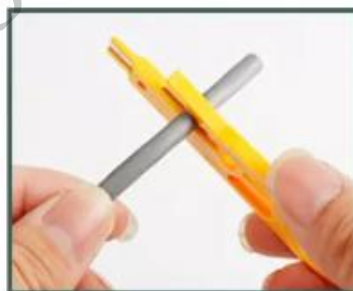
2. Put the network cable into the knife edge