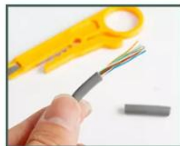
6. successfully stripped