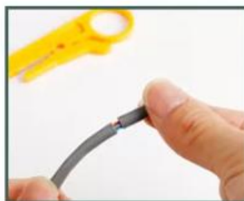
5. Take down outside of cable