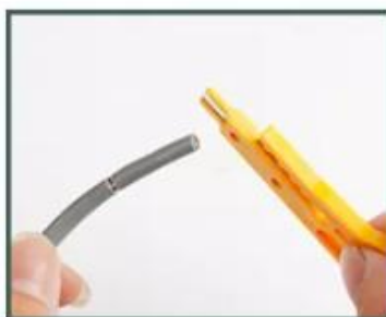
4. Loosen the wire stripper