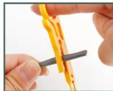
3. Rotate the stripping knife one circle with the network cable as the center