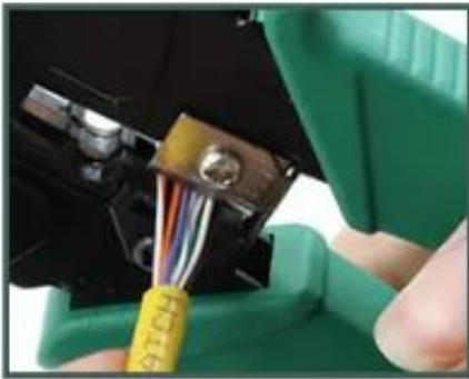
4. Put the thread into the trimming port and cut it neatly