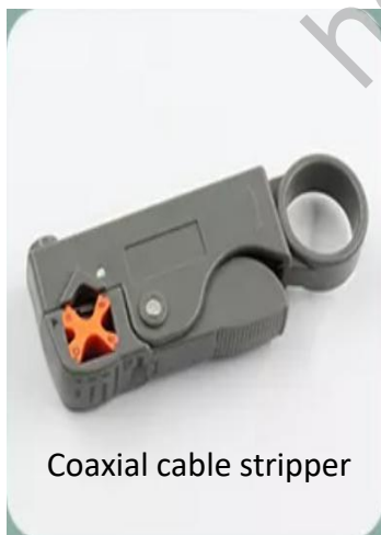
Coaxial cable stripper