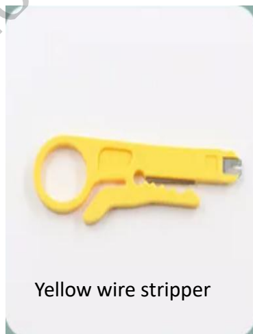
Yellow wire stripper