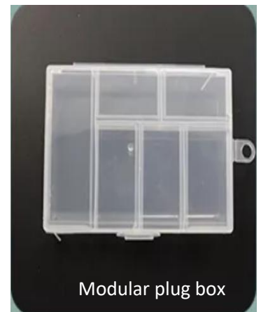
Modular plug box