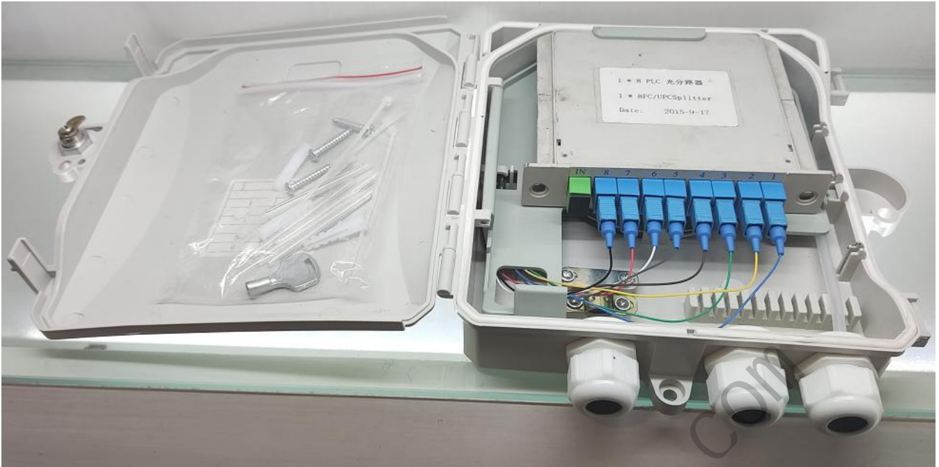
Full loaded box