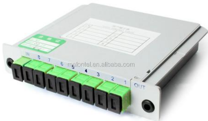
Card type PLC splitter