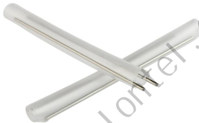
C type with 2 steel for drop cable