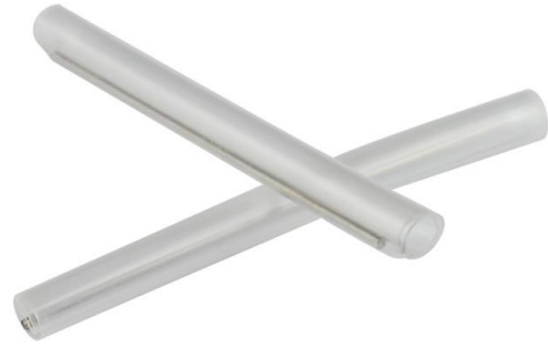
B type for drop cable