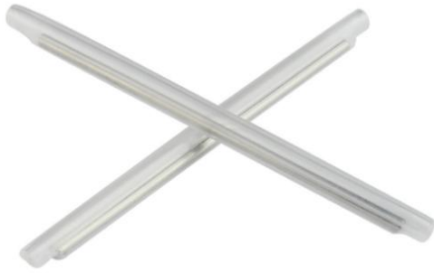
A type for normal fiber