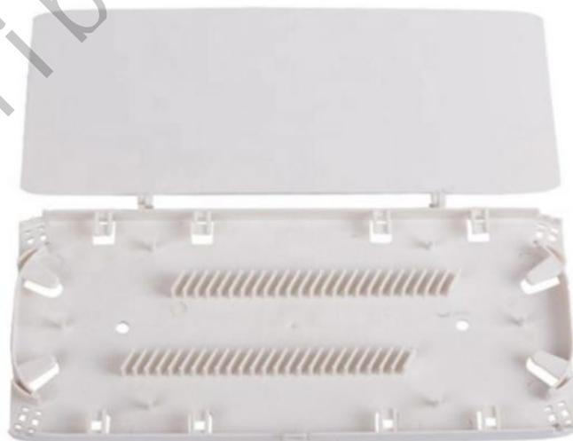
48 core splicing tray

Bracket for wall mounted, pressure valve, pole mounted kits.