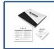
User' s manual Quality Certificate Warranty Card