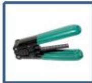
Wire stripping pliers