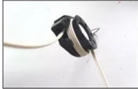
Without Suspension Wire

(in case of fiber optics diameter is /3.3mm*2.0mm):2 turns