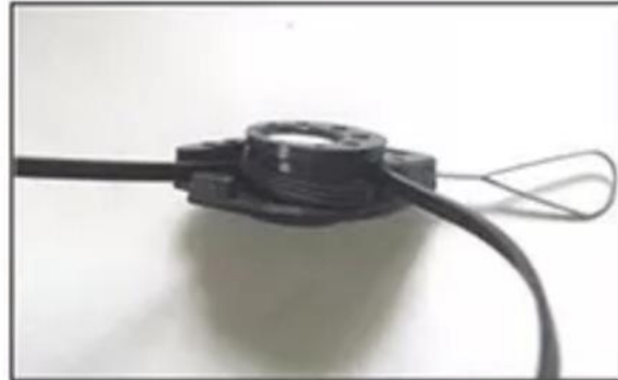
With Suspension Wire

(in case of fiber optics diameter is /5.0mm*2.0mm):2 turns